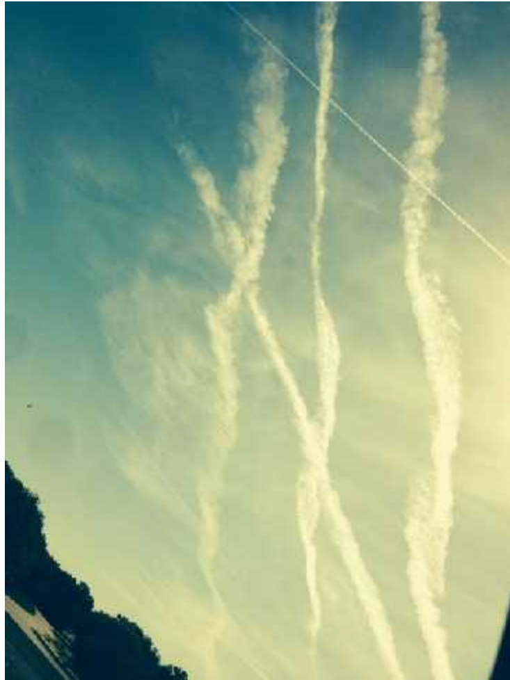
April 12, 2019