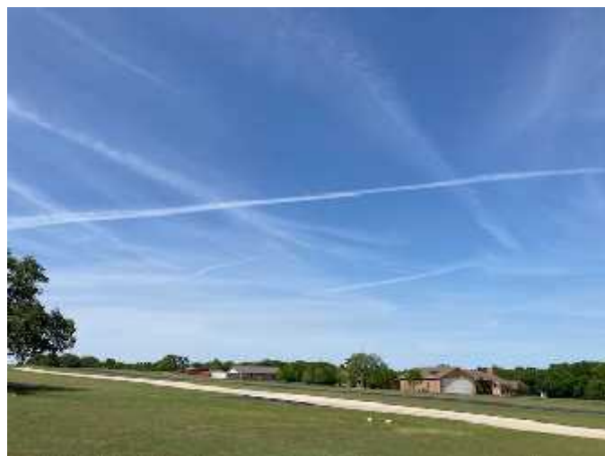
May 1, 2022