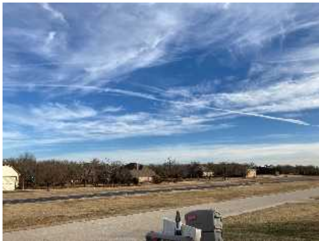
17 Jan 2023