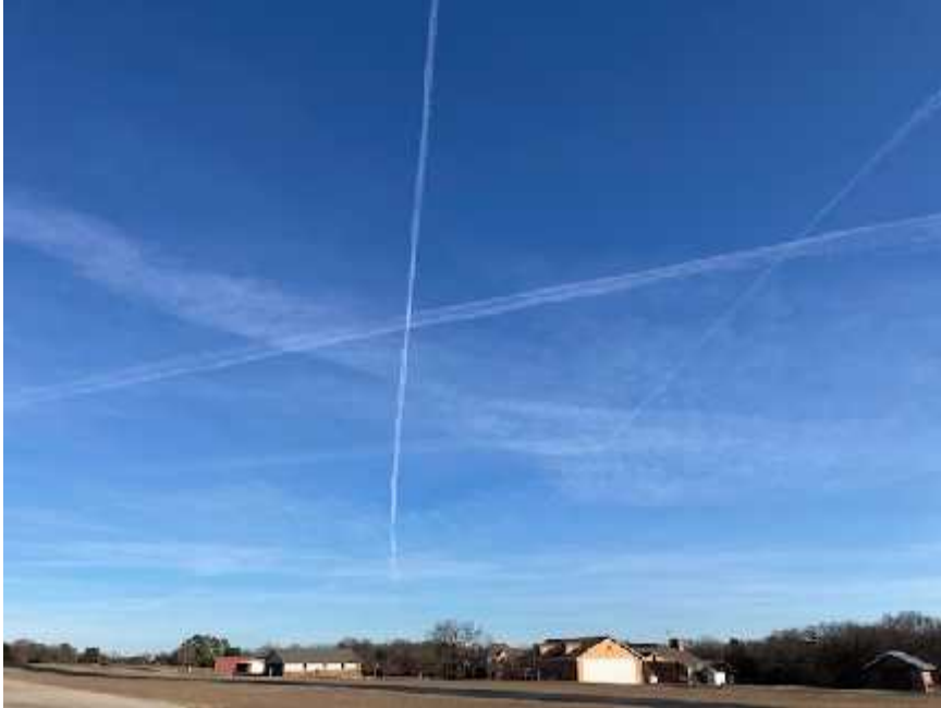
Jan 13, 2022