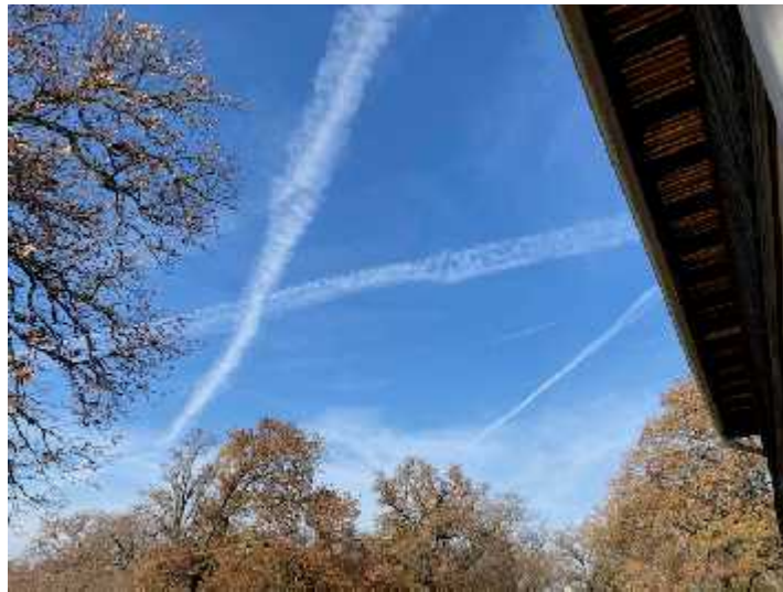
9 Dec 1022