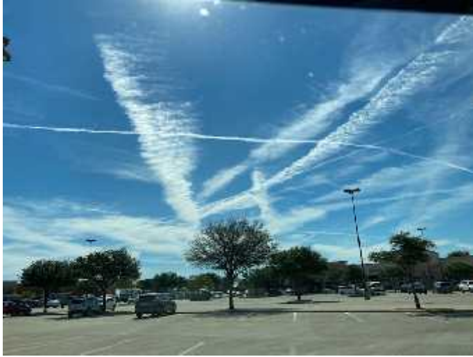
Sep 24, 2021