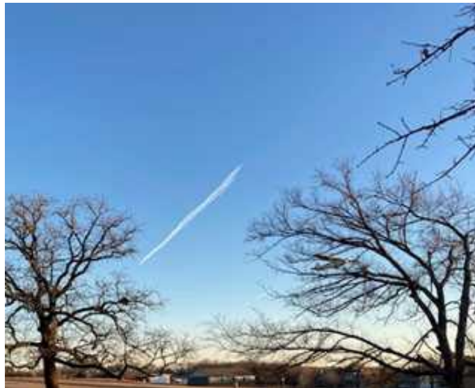
10 Jan '23