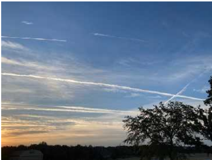
7 Oct 2022