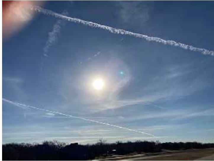
13 Jan 2022