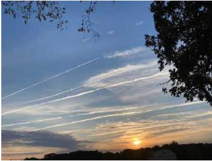
Oct 7, 2022

The long list is to emphasize (maybe over-emphasize) just how much spraying they are doing.