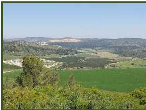
Valley of Elah (Terebinths) – 20 sw of Jerusalem