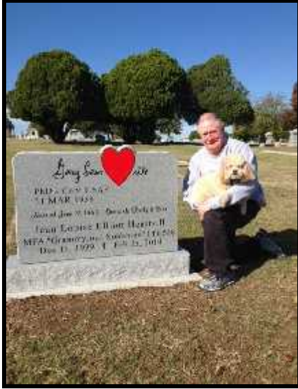
"Not many of us left..." 1